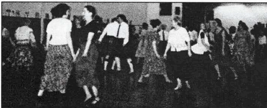
Dances having fun at the March Branch Dance why join us for the 35th birthday dance it is guaranteed to be a good night!

This year the Branch is celebrating it's 35th birthday. Over the years and definitely every fifth year it has become the custom to have the real celebration and also an official one too - rather like our Patron The Queen. This year our actual birthday falls on the third Saturday in June when we have a Branch dance. As I was persuaded to MC that dance I decided to look back at our early programmes and create some link with them. In the first few years we had two branch dances a year and from these ten programmes I have taken the most popular dances to make up half the June programme. From the numbers after the dances you will see how many times they appeared in our early days. You may be as surprised as I was but delighted to see that most remain popular today. I hope to see you at our 35th Birthday Dance on June 21st.